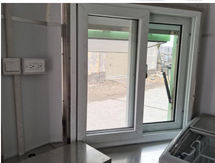
- Windows -