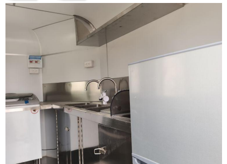
- Sinks -