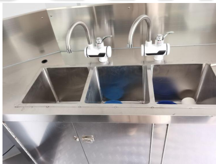
- Sinks -